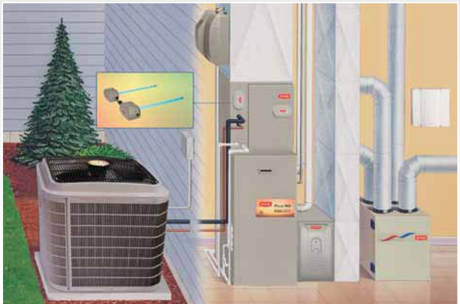
Air Conditioner and Gas Furnace System

Minnesota Heating and Air Conditioning Incorporated 10701 93rd Avenue North Maple Grove, Minnesota 55369 Office: (763) 424-5235 Service Ext. 301 Sales Ext. 302 Fax: (763) 424-8970 Office Hours: Monday - Friday 8:00 A.M. - 5:00 P.M. Saturday 8:00 A.M. - 12:00 Noon